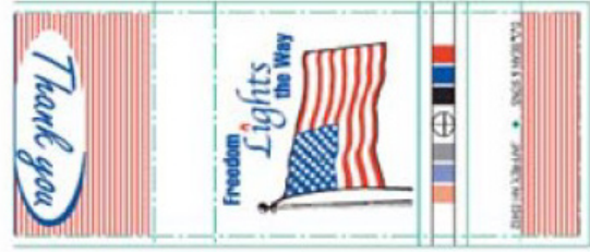
Figure I-1 Commodity matchbooks: Commodity matchbook cover

Commodity matchbooks consist of paper match stems fastened into a matchbook cover. The cover is usually made of plain white paperboard, which is sometimes printed with a simple generic message or image, such as "Thank You," the American flag, or a chain store logo. Figure I-1 shows an example of a commodity matchbook cover. A composition of red phosphorus, polyvinyl acetate, and ground glass is applied to the cover for use as a striking surface. The match stem is made from paperboard and is tipped with a match head composed of a chemical mixture (usually potassium chlorate, ground glass, gelatin, sulfur, diatomaceous earth, and carboxymethylcellulose), which ignites as the result of a chemical reaction when struck on the striking surface. Commodity matchbooks contain 20 matches, equaling the quantity of cigarettes in a pack. All commodity matchbooks consumed in the United States, whether imported or made in the United States, are required to meet U.S. consumer product safety standards.