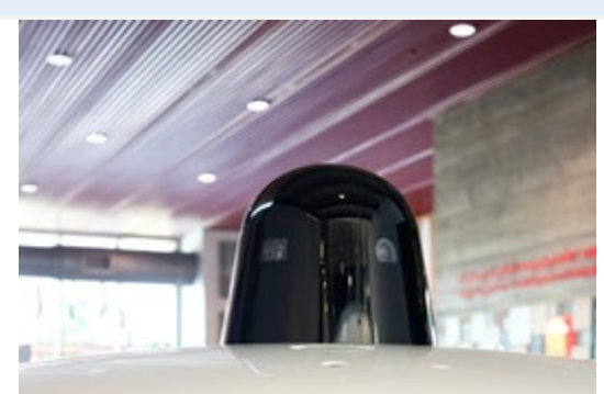
Figure 3 Roof mounted LiDAR

Source: Plougmann, "Top LiDAR Scanner and a Peek Inside the Cabin" <u>https://www.flickr.com/photos/criminalintent/20823743810</u> under a creative commons license. Note: Photo was modified to focus on the LiDAR.