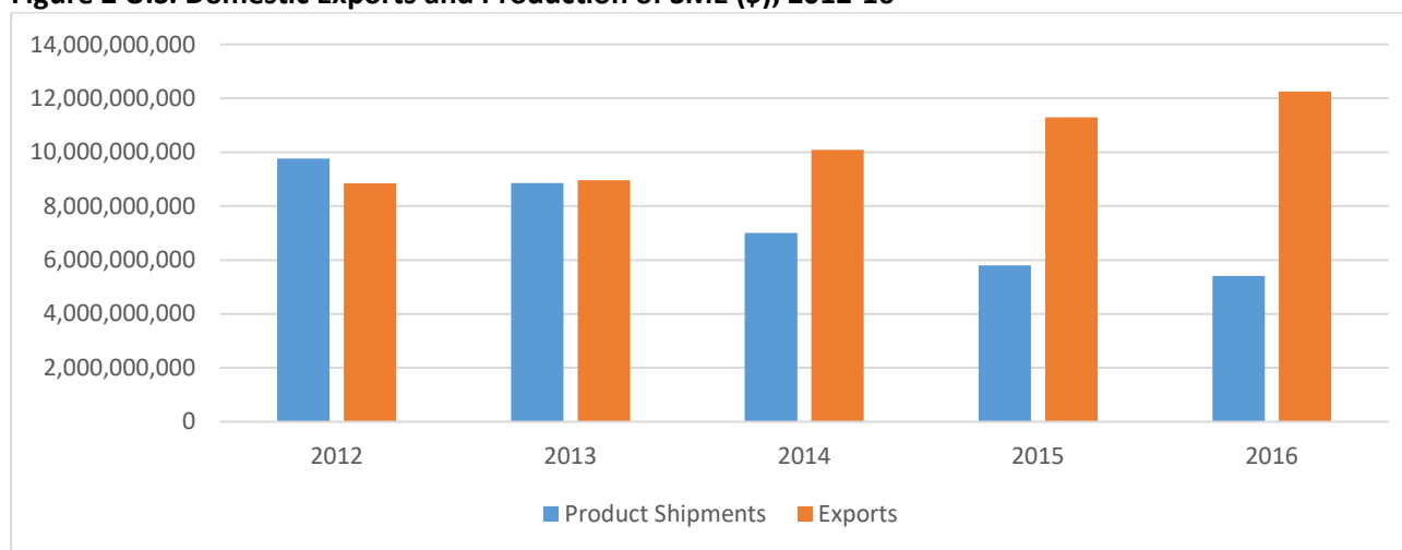
Figure 2 U.S. Domestic Exports and Production of SME ($), 2012-16

The growth of the used SME market and sale of this used equipment has resulted in domestic exports of semiconductor manufacturing equipment, which do not distinguish between new and used equipment, exceeding reported total domestic production (Figure 2).