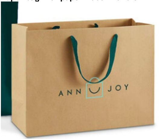
Figure I-4 Paper bag with paper ribbon handle