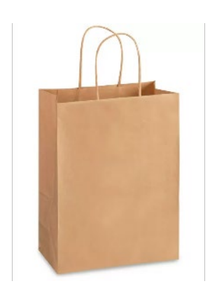
Figure I-1 Kraft paper shopping bag