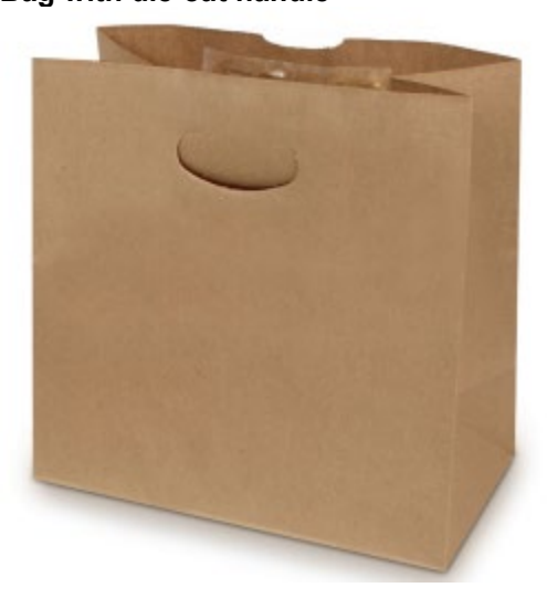
Figure I-5 Bag with die-cut handle