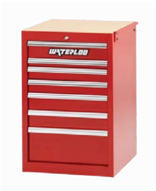
Figure I-5 Side cabinet