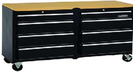
Figure I-6 Mobile workstation