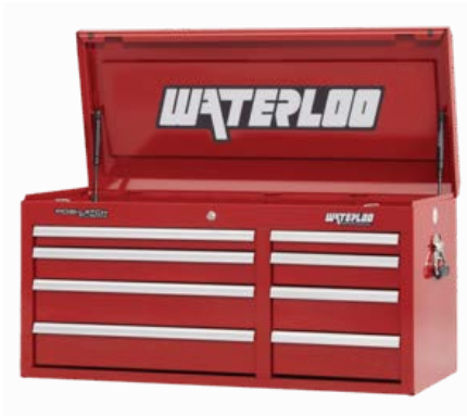
Figure I-2 Top chest