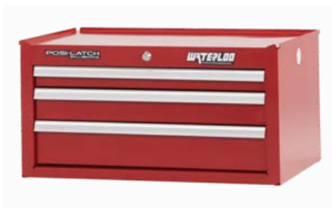
Figure I-3 Intermediate chest