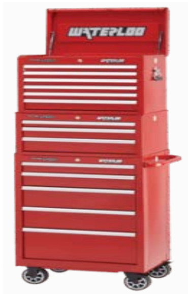
Figure I-1 Tool cabinet with top and intermediate chests