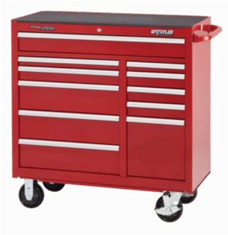
Figure I-4 Tool cabinet